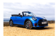
MINI Sale Event. 4 to 8 September. MINI

A Police Scotland spokesperson said: "Around 4.50am on Monday, June 16, we received a report of fire damage to a mosque on Whins Road, Alloa.