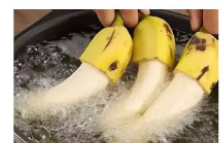
Physiotherapist: 'This Is The Worst Enemy Of Arthritis' Joint Health Boost