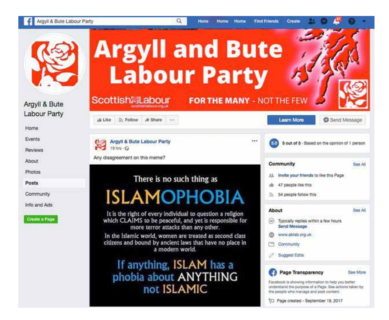
A post by the Argyll and Bute Labour account.88

If political leaders do not take meaningful steps towards eliminating hate within their own parties, they cannot hope to inspire tolerance and understanding across society; nor can they hope to inspire confidence in the communities they seek to represent.