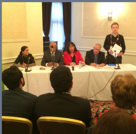
Sir Keith Vaz and Owen Jones speak at MEND Labour fringe 2014