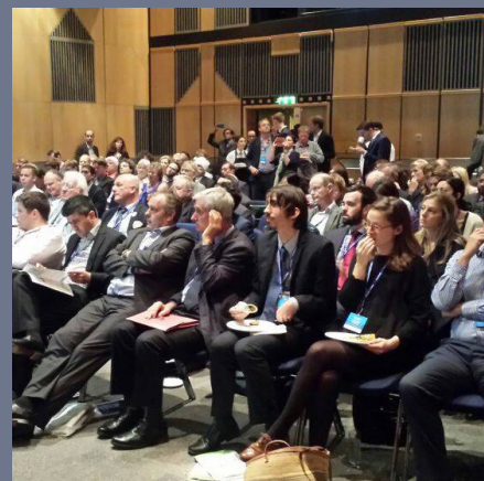
Conservative conference 2014